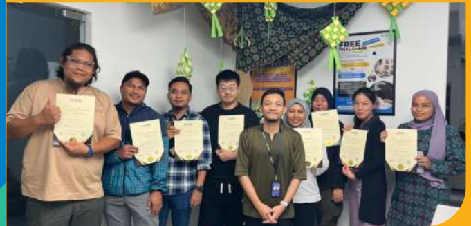
Software Training Autodesk Certified Exams