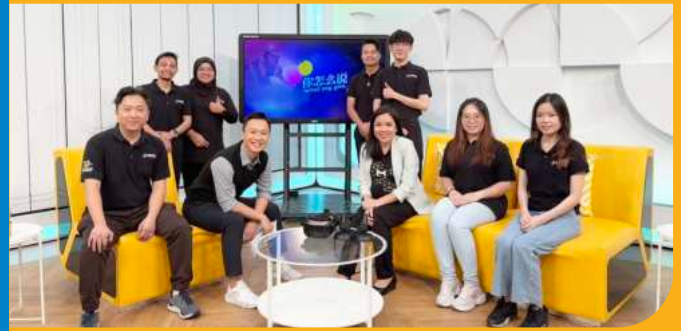
RTM - TV LiveShow feature