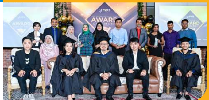
MTTC Award Ceremony