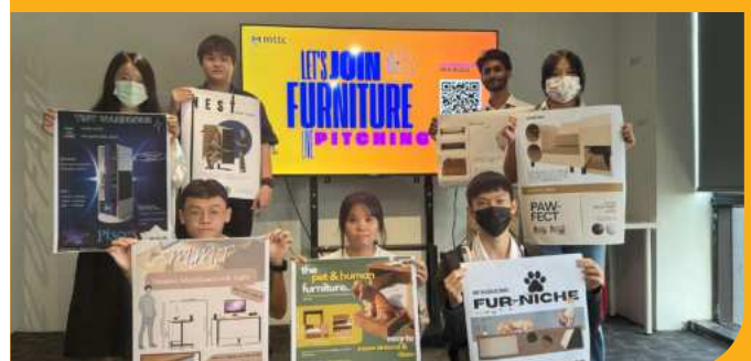
Student Competition - MTTC Shark Tank

PJ CAMPUS 603 • 7931 3139 Menara Harvey Norman Block B, Level 3, Menara Harvey Norman, Seksyen 51a, 46100 Petaling Jaya, Selangor.